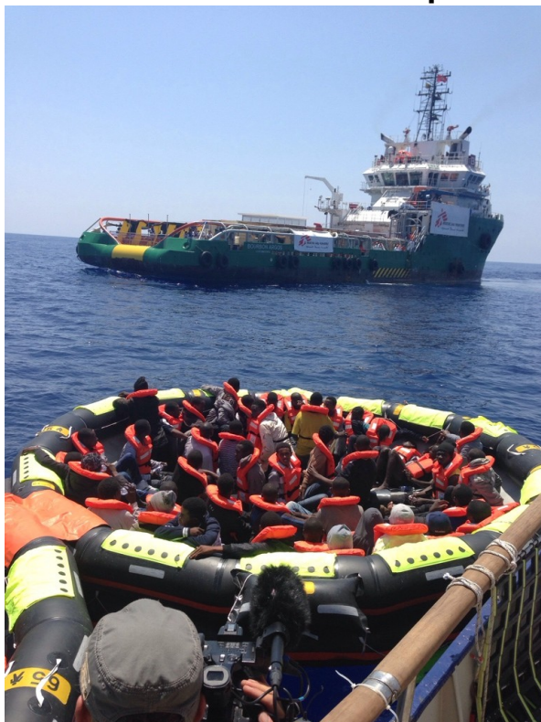
Operation of the Sea Watch with rescue isles, in the background Bourbon Argos of Medicine Sans Frontieres.

Mid-June the SeaWatch has been arrived in Lampedusa and already during their second mission (beginning of July) they contributed crucially for the rescue of more than hundreds of boatrefugees.