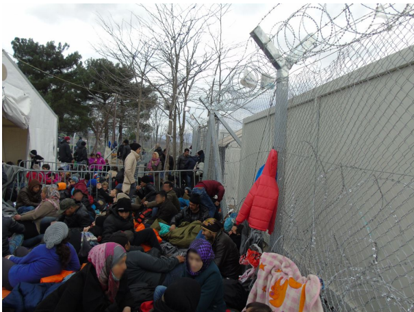
Eidomeni, Greece, 7 March 2016

7 March 2016 – a new round for polarization. The Balkan route is so to say closed, NATO ships are in the Aegean, Calais vacated, the Asylum package is rushed through and the extreme right-wing persons of the AfD rise – on all levels we are confronted with a racist rollback. The EU-border regime should be straighten up with might and main and the control over the flight and migration movement should be restored at any cost.