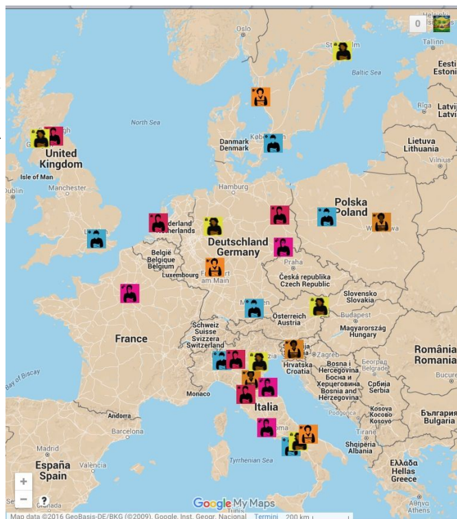
1st of March 2016 against border and precarization!