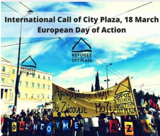
International Call of City Plaza, 18 March European Day of Action